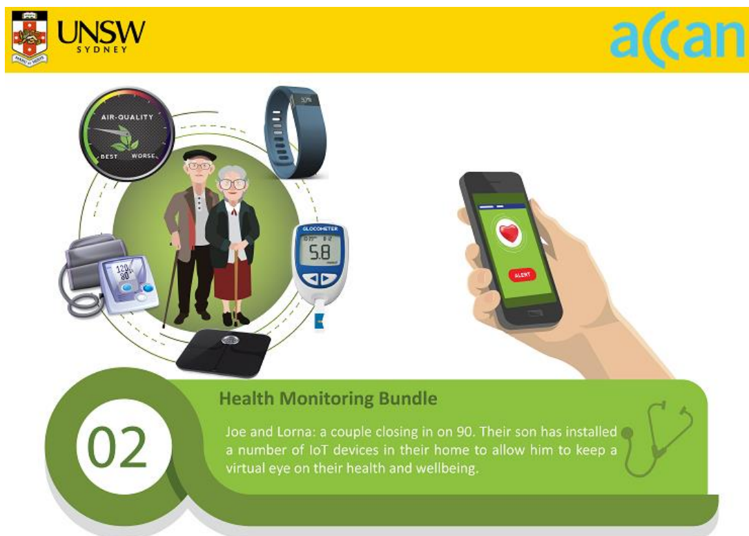
Figure 3: Case 2 – Health monitoring bundle for an elderly couple