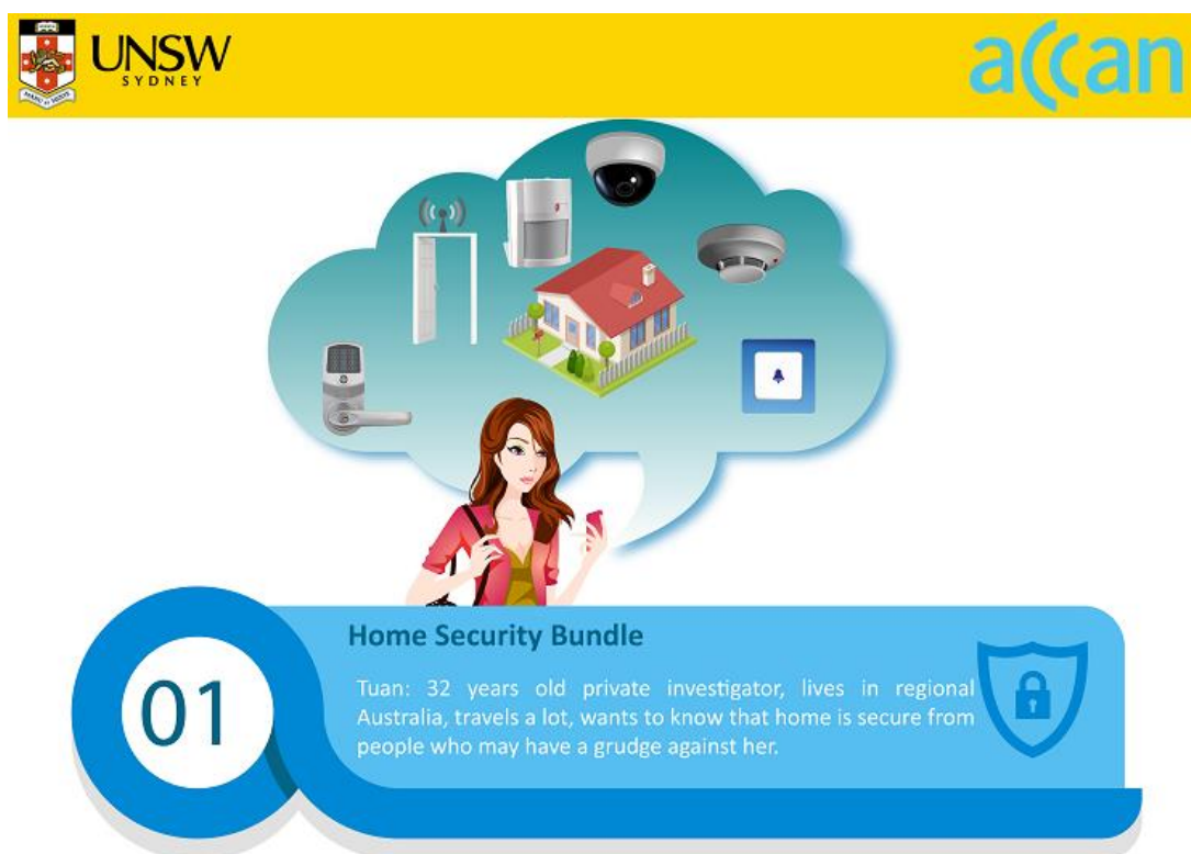
Figure 2: Case 1 – Home security bundle for a single occupier