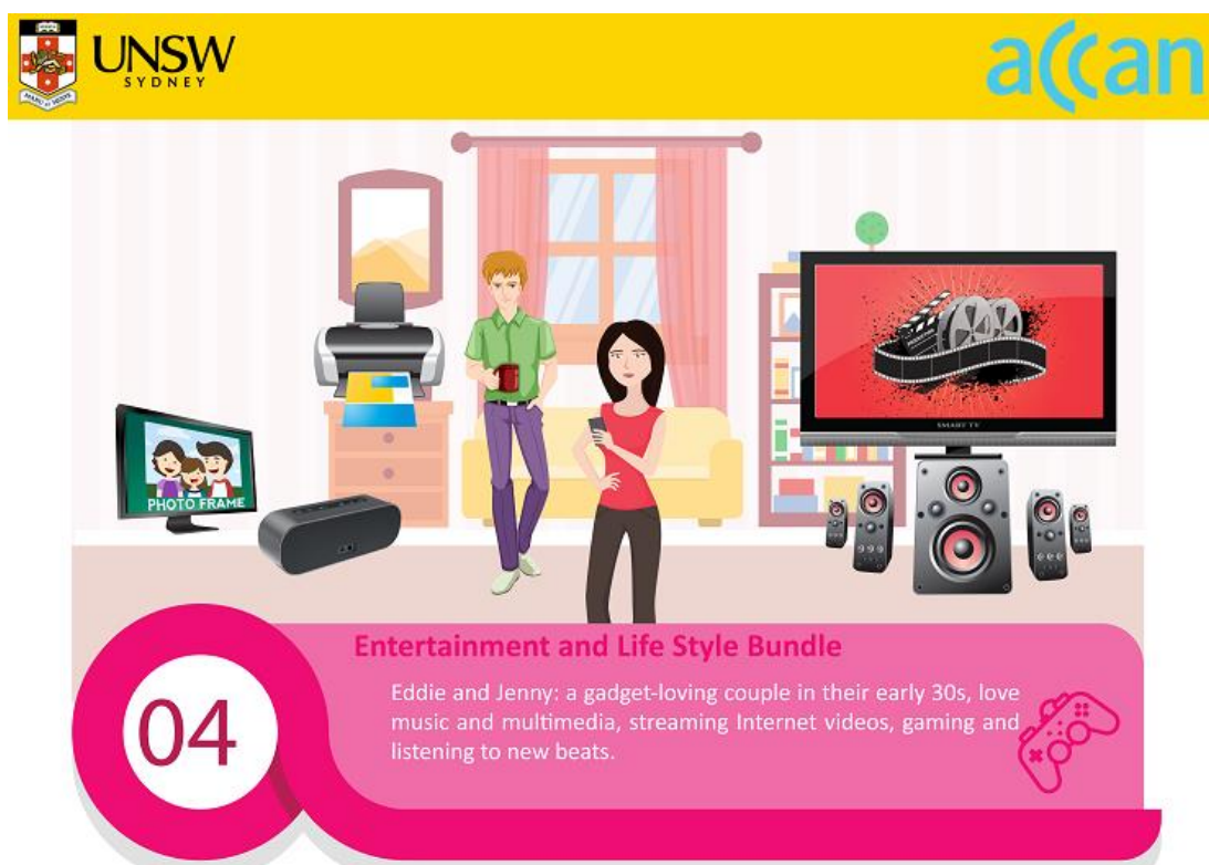
Figure 5: Case 4 – Entertainment and lifestyle bundle for a young couple