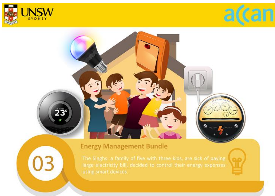
Figure 4: Case 3 - Energy management bundle for a family home