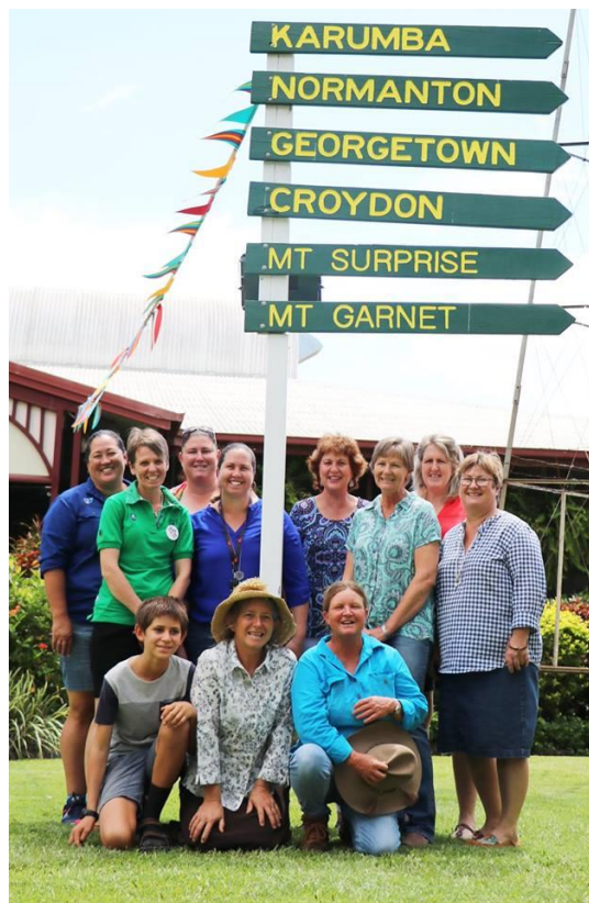
Image 1: Participants in NGRMG's Bush Business program (Image courtesy of NGRMG).

There are virtually no digital literacy programs in FNQ apart from the ad hoc sessions run by community groups and councils. Furthermore, self-led online courses are largely inaccessible because they are too data heavy (e.g. videos cannot be viewed or downloaded). Some programs, such as Northern Gulf Resource Management Group's (NGRMG) Bush Business, are offered in rural centres like Mareeba, but attendees must travel hundreds of kilometres and leave properties unattended in order to participate, which is often not possible.