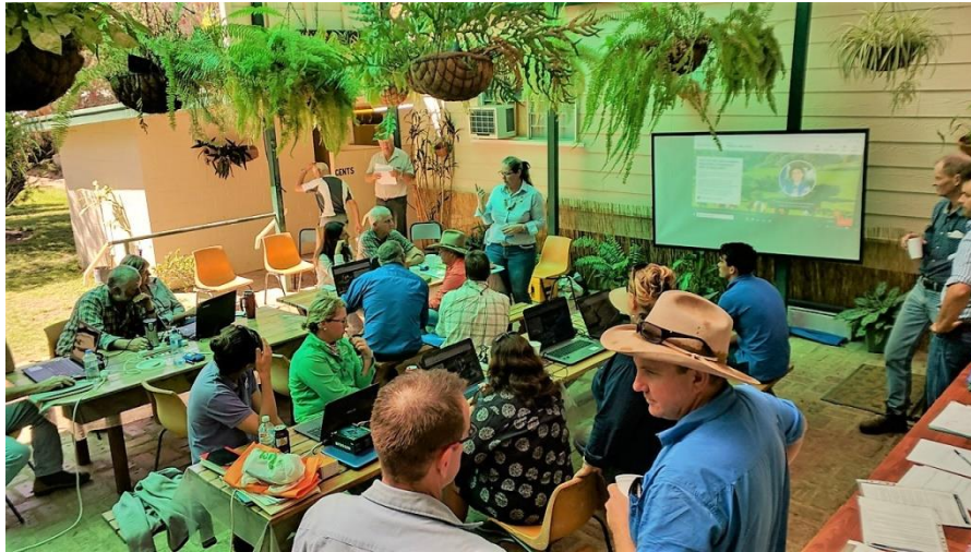
Image 2: Online LPA animal welfare module workshops at Northern Gulf's toolbox talk, Almaden Pub.

Rural FNQ households are also increasingly reliant on mobile and internet coverage across properties and between townships. Mothers spoke to me about trouble coordinating school drop off and pick up (up to an hour each way), particularly if the mobile network is down, which is a common occurrence. Others spoke of their inability to respond to emergencies, such as a vehicle accident or bush fire, because of the limited options available to raise the alarm and coordinate resources. While two-way radios are tried and true technologies in the bush, they rely on people being in range and on the correct channel. This limits the network of respondents to those in physical proximity to the incident.