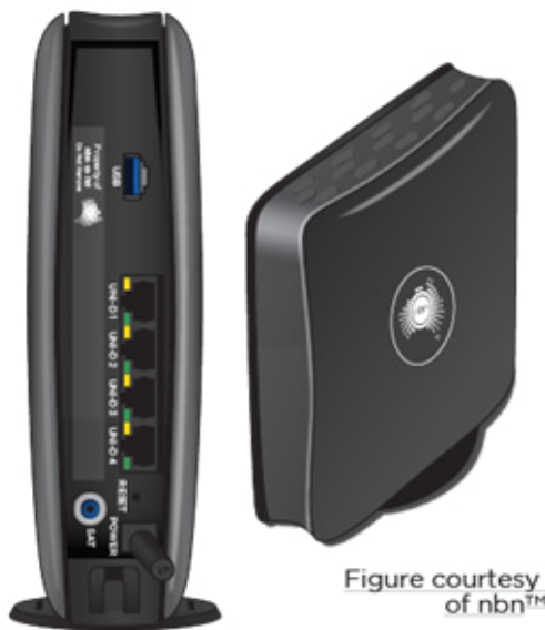
Left image: router