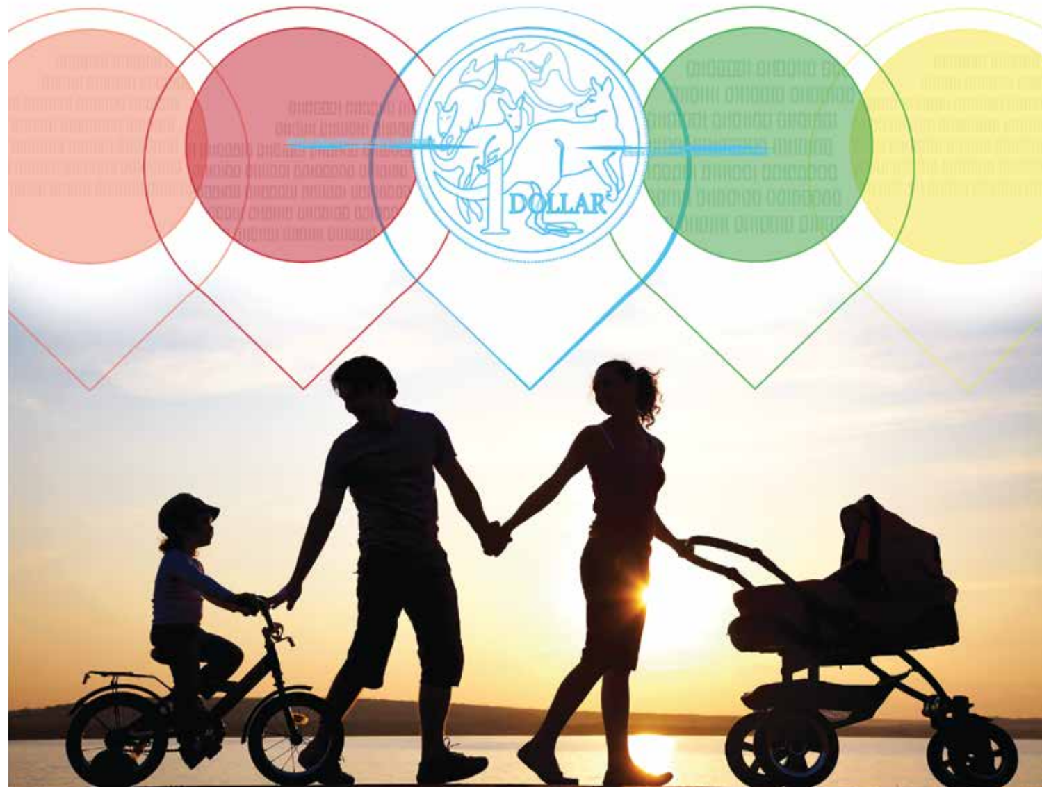
Australia's peak body for communications consumers

ACCAN National Conference: 1st & 2nd September 2015 accan.org.au/affordability